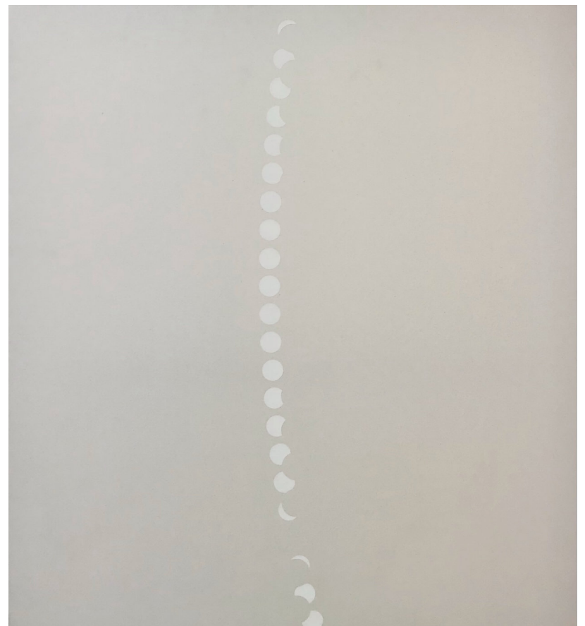
Kiss 37 53 x 48 ins