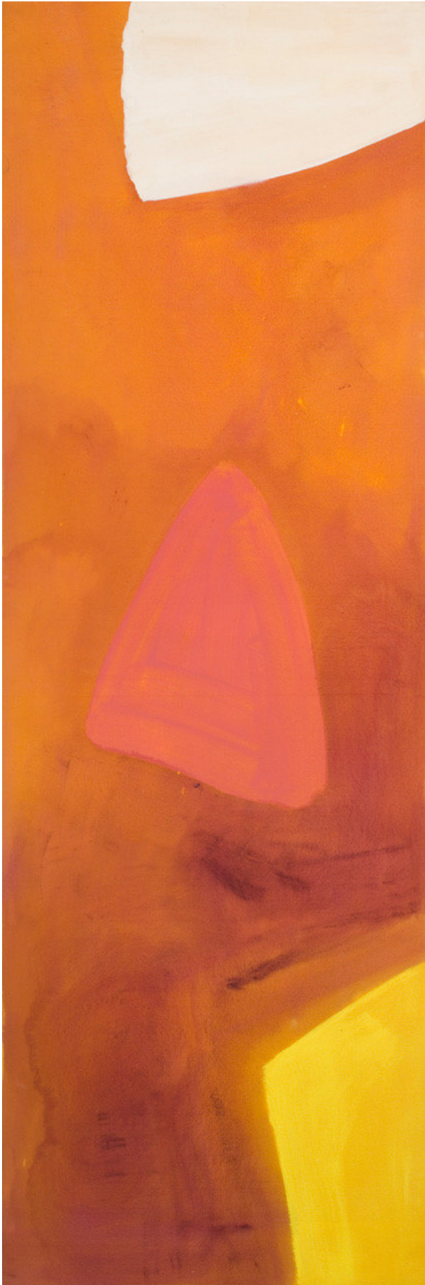
Coral in Ochre , 1993 acrylic on canvas 245 x 81.5 cm