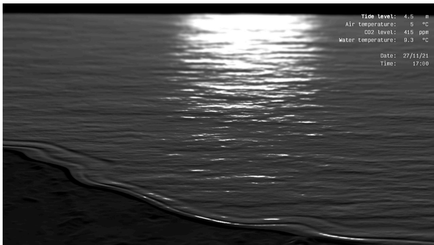
WHABBstudio. Photographs of the Ebb _ Flow installation, exhibited at Troy House Art Foundation, commissioned by Wandsworth Council, 2022